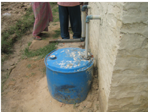
Figure 2: With urine separation one option is to collect the urine so that it can be used as a liquid fertiliser later on.

Compost toilets are often built with two chambers for simplicity of construction and operation. The two chambers are used alternately; decomposition continuing in the full one until it is emptied just prior to the other one becoming full. Each chamber has its own opening for removal of mature, non-odorous compost. Some types of compost toilet batch the waste in movable receptacles on trolleys or turntables whilst others generate the compost slowly and continuously as the material progresses through the device. Some require electricity for small heating elements (in cold climates) or fans (to ensure a positive airflow through the system). Some compost toilets combine the urine and faeces whilst others separate them. The compost formed by the combination of urine and faeces is better as the urine contains valuable nutrients but these toilets are more likely to smell if used carelessly and they require much greater quantities of carbonaceous residues like sawdust and straw. However, urine can be used on its own as a liquid fertiliser so that the nutrients are not lost. It is collected and stored for a time before being used on agricultural land. It is relatively safe to handle and store. More complex types of compost toilet design require dry access under the toilet via a basement or cellar room.